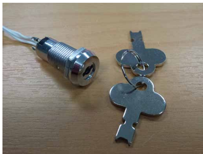
New Key Switch