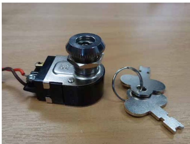
Old Bulgin Key Switch