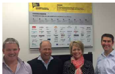
Staff at Enterprise Recruitment showing their support for the Charter.