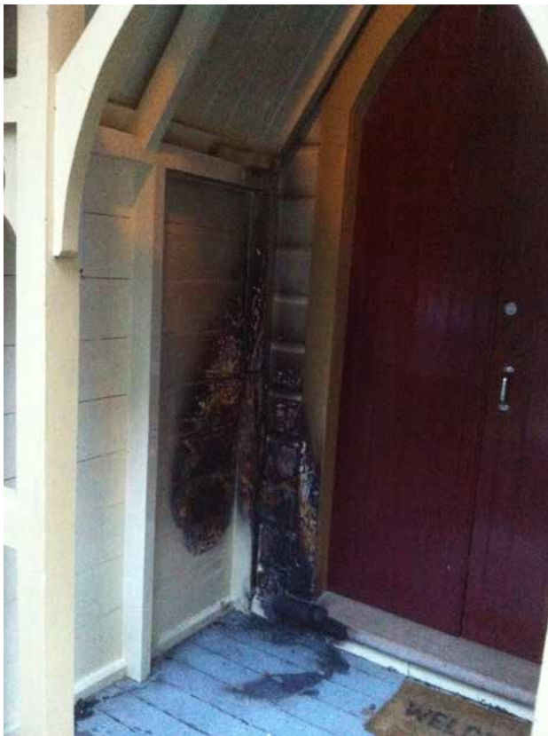
Arson attempt on old rural church