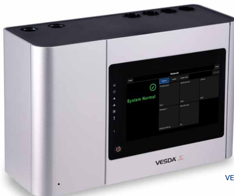
VESDA-E by Xtralis

For more information contact Holly Clamp +61 3 9936 7220 or register your interest by clicking here.