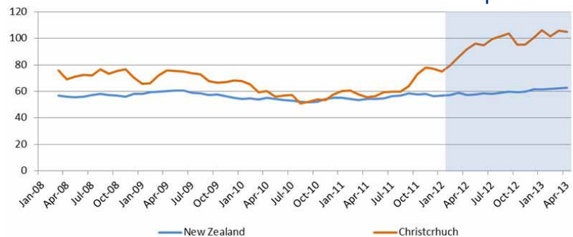
Rate of Construction Serious Harm Notification per 10,000 employee (12 months moving average) in Christchurch and New Zealand: Jan 2008 – Apr 2013